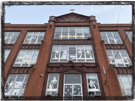
Santa kneels before the baby Jesus in this year's Christmas window display on the front side (middle window) of Holy Trinity School in Wallingford.

Just in time for the Wallingford Stroll in December, the eighth-grade students at Holy Trinity School in Wallingford completed their annual Christmas window display – to the delight of school neighbors and town residents.