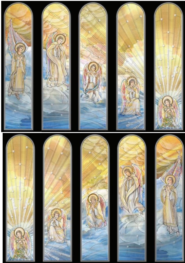
Adoring Angels Windows Behind the Altar

100% of your donation will go to this effort.