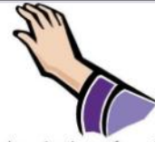
Anointing the sick

ALL DONATIONS ARE WELCOMED AND APPRECIATED!!