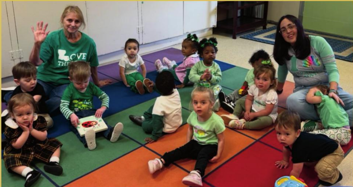
Students in Arise Studio having fun while learning shapes!