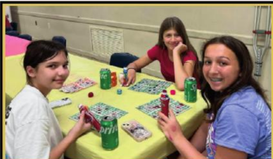
Easter Bingo was a hit. Family fun, lots of laughter and so many prizes won.