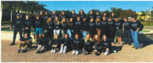
2021 Fly-in group enjoying their time on campus