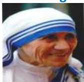
Saint Mother Teresa of Calcutta

I take the Lord at his word. Faith is a gift from God. Without it there would be no life. And our work, to be fruitful and beautiful, has to be built on faith. Love and faith go together. They complete each other.