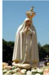
Our Lady, Protector of Ukraine, pray for peace.

The Chaplet of the Divine Mercy is recited every Sunday at 8:10am at St. Francis Church. The Rosary is recited daily at St. Francis Church after the 12 noon Mass.