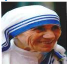
Saint Mother Teresa of Calcutta

"We are entirely at the disposal of the Church. We profess a deep personal love for the Holy Father. We surrender ourselves completely to be united with Him as carriers of God's love. Pray for us that we don't spoil the work God has called us to do."