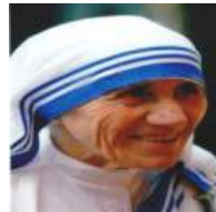
Saint Mother Teresa of Calcutta

"We never base our assistance on the religious beliefs of the needy, but on the need itself. We are not concerned with the religious beliefs of those we help. We only focus on their urgent need for our love and care."