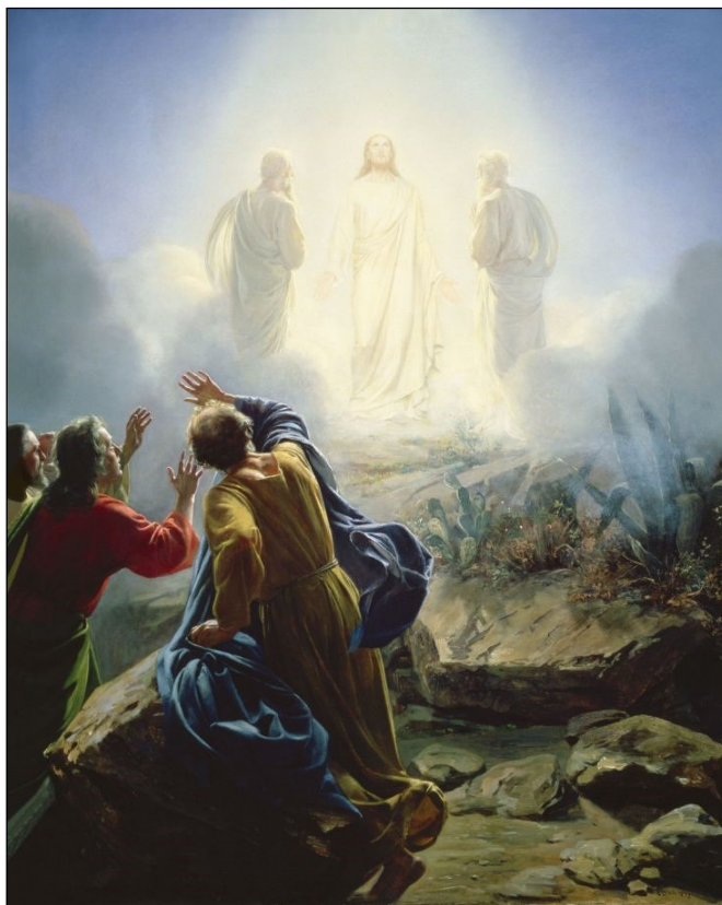
Painting by Carl-Heinrich Boch, Denmark, 1800s

Even the Transfiguration is an event meant for everyone, not just a trusted few.