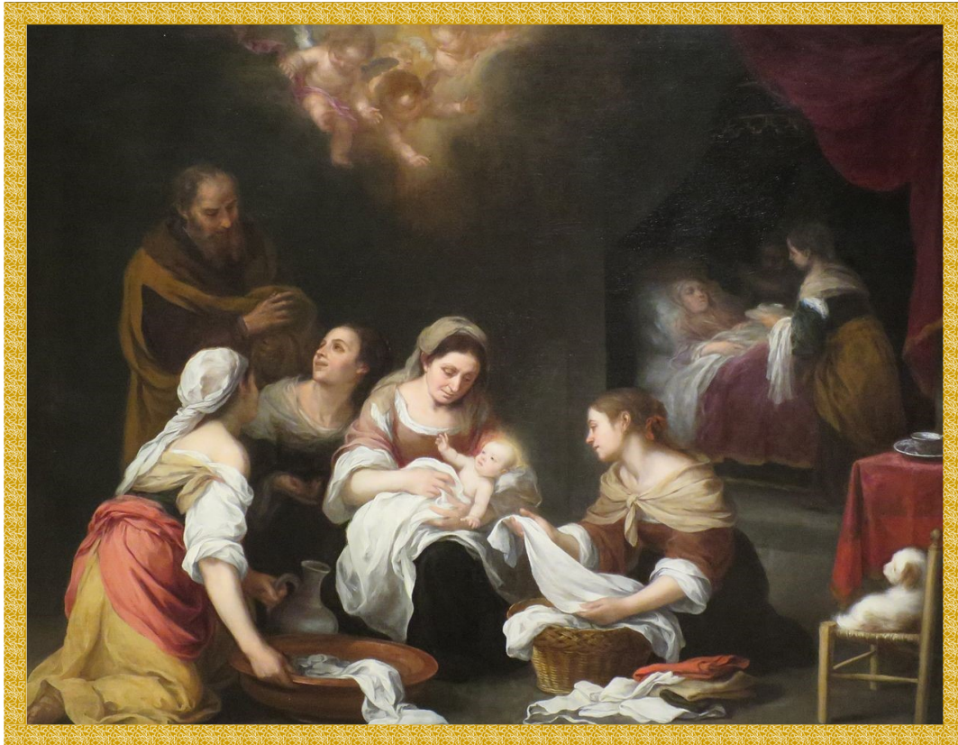
Bartolome Esteban Murillo (1617-1682) The Birth of John the Baptist