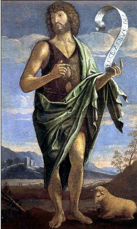
'John the Baptist' by Bartolomeo Veneto 1502-1555