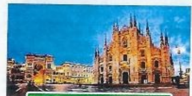
CATHEDRAL OF MILAN, ITALY

CATHOLIC PILGRIMAGE TOUR TO SWITZERLAND, ITALY & ROME