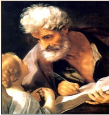
ST. MATTHEW CHURCH 616 Warburton Avenue Hastings on Hudson, NY 10706