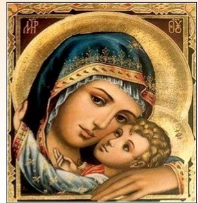
OUR LADY OF PERPETUAL HELP CHURCH 535 Ashford Avenue Ardsley, NY 10502