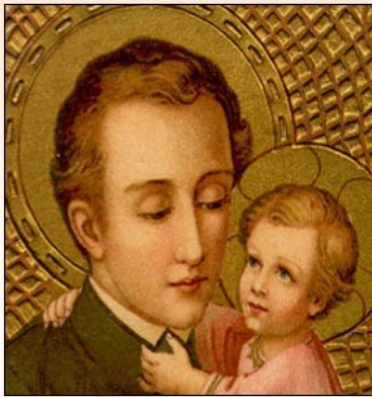
ST. STANISLAUS KOSTKA Rectory.....914-478-2822 www.stmolph.com