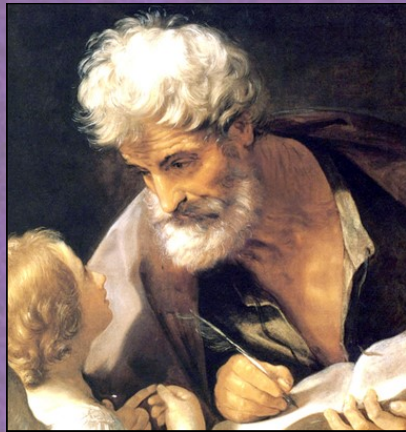
ST. MATTHEW CHURCH 616 Warburton Avenue Hastings on Hudson, NY 10706 Rectory.....914-478-2822