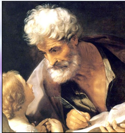
ST. MATTHEW CHURCH 616 Warburton Avenue Hastings on Hudson, NY 10706 Rectory.....914-478-2822