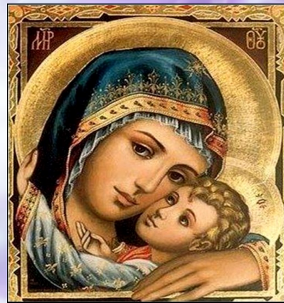
OUR LADY OF PERPETUAL HELP CHURCH 535 Ashford Avenue Ardsley, NY 10502 www.stmolph.com

December 5, 2021 • Second Sunday of Advent