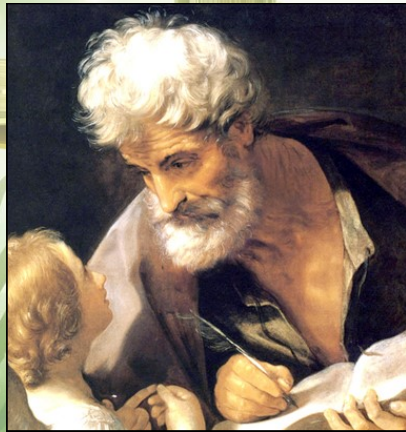
ST. MATTHEW CHURCH 616 Warburton Avenue Hastings on Hudson, NY 10706 Rectory.....914-478-2822