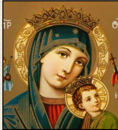
Our Lady of Perpetual Help 535 Ashford Avenue Ardsley, NY 10502 www.stmolph.com

July 17, 2022 • 16th Sunday in Ordinary Time