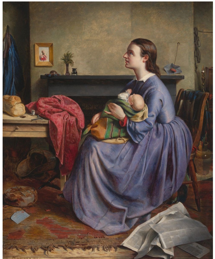
*Image: Lord, Thy Will Be Done by Philip Hermogenes Calderon, 1855 [Yale Center for British Art, New Haven, CT]

Reprinted with permission, The Catholic Thing