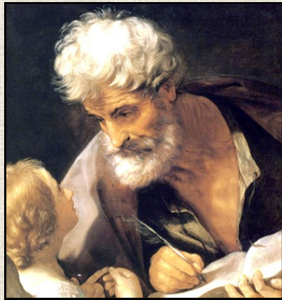
Church of St. Matthew 616 Warburton Avenue Hastings on Hudson, NY 10706 Rectory.....914-478-2822