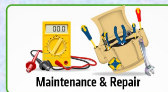
Maintenance & Repair

Thank you to 104 parishioners who regularly give monthly via Parish Giving! Won't you join too?