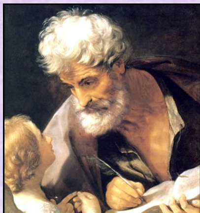
Church of St. Matthew 616 Warburton Avenue Hastings on Hudson, NY 10706 Rectory.....914-478-2822