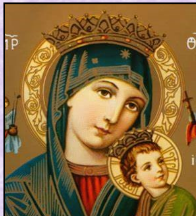
Our Lady of Perpetual Help 535 Ashford Avenue Ardsley, NY 10502 www.stmolph.com

December 4, 2022 • Second Sunday of Advent