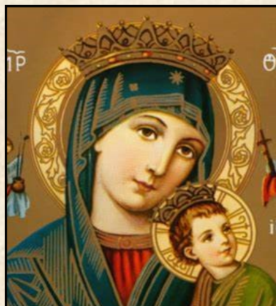
Our Lady of Perpetual Help 535 Ashford Avenue Ardsley, NY 10502 www.stmolph.com

January 15, 2023 • Second Sunday in Ordinary Time