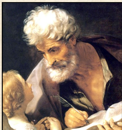
Church of St. Matthew 616 Warburton Avenue Hastings on Hudson, NY 10706 Rectory.....914-478-2822