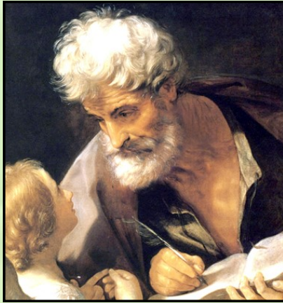
Church of St. Matthew 616 Warburton Avenue Hastings on Hudson, NY 10706 Rectory.....914-478-2822