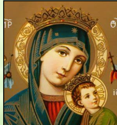
Our Lady of Perpetual Help 535 Ashford Avenue Ardsley, NY 10502 www.stmolph.com

June 25, 2023 • 12th Sunday in Ordinary Time