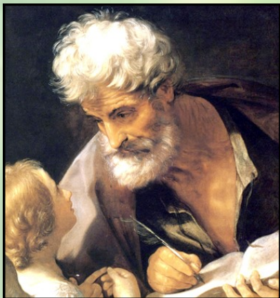
Church of St. Matthew 616 Warburton Avenue Hastings on Hudson, NY 10706 Rectory.....914-478-2822