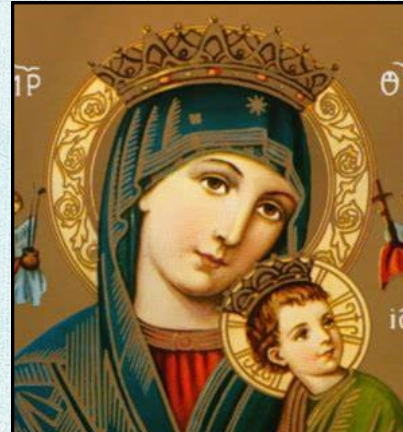
Our Lady of Perpetual Help 535 Ashford Avenue Ardsley, NY 10502 www.stmolph.com

August 13, 2023 • 19th Sunday in Ordinary Time