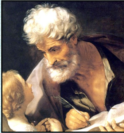
Church of St. Matthew 616 Warburton Avenue Hastings on Hudson, NY 10706 Rectory.....914-478-2822