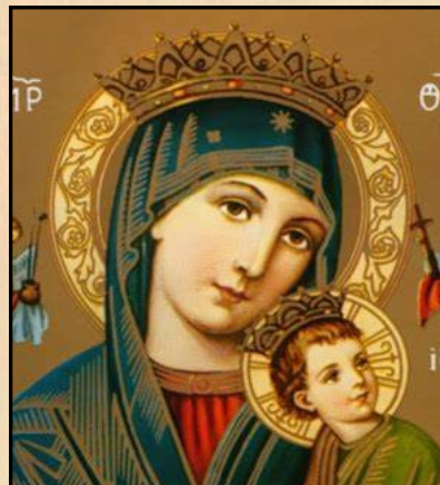
Our Lady of Perpetual Help 535 Ashford Avenue Ardsley, NY 10502 www.stmolph.com

September 17, 2023 • 24th Sunday in Ordinary Time