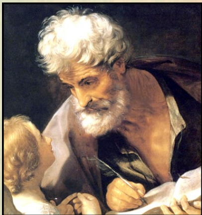
Church of St. Matthew 616 Warburton Avenue Hastings on Hudson, NY 10706 Rectory.....914-478-2822