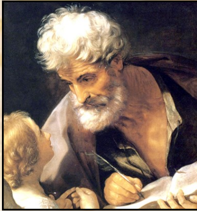
Church of St. Matthew 616 Warburton Avenue Hastings on Hudson, NY 10706 Rectory.....914-478-2822