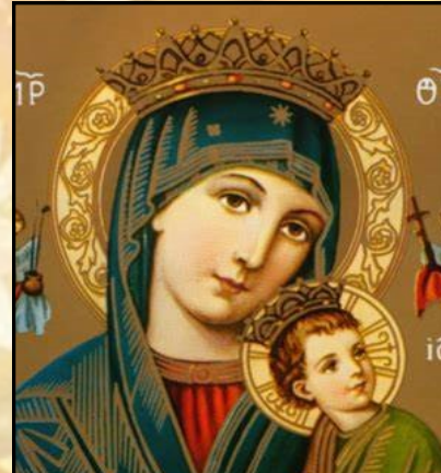
Our Lady of Perpetual Help 535 Ashford Avenue Ardsley, NY 10502 www.stmolph.com

October 29, 2023 • 30th Sunday of Ordinary Time