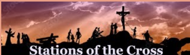
Stations of the Cross

9:00am Mass - 3:00pm Service - 6:30pm Mass