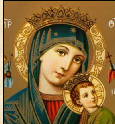
Our Lady of Perpetual Help 535 Ashford Avenue Ardsley, NY 10502 www.stmolph.com

February 11, 2024 • 6th Sunday in Ordinary Time