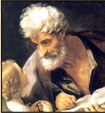
Church of St. Matthew 616 Warburton Avenue Hastings on Hudson, NY 10706 Rectory.....914-478-2822