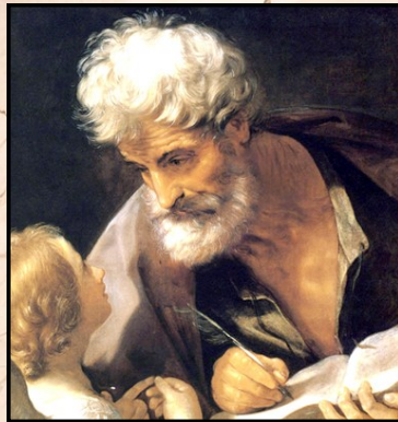
Church of St. Matthew 616 Warburton Avenue Hastings on Hudson, NY 10706 Rectory.....914-478-2822