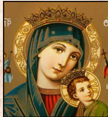
Our Lady of Perpetual Help 535 Ashford Avenue Ardsley, NY 10502 www.stmolph.com