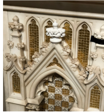
Refabricated and installed 14 missing/fractured decorative stones on the main altar as well as 8 on the side altars.