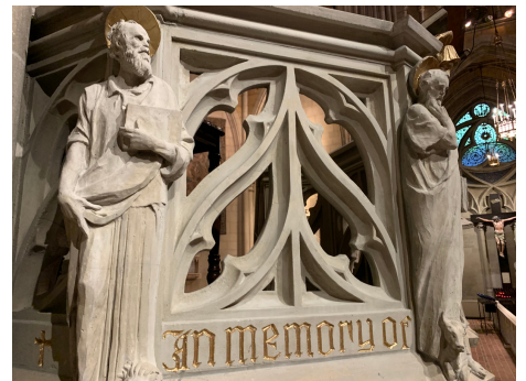
Repainted pulpit lettering in its original hue.