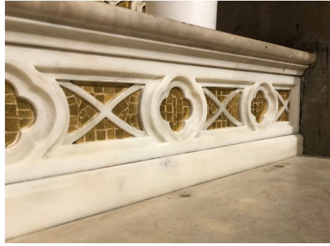
Before vs. after a deep wire brush clean of the side altar.