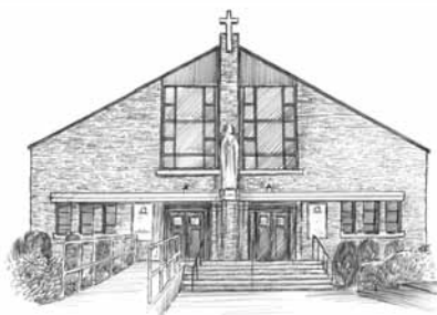
St. Teresa of the Infant Jesus 1634 Victory Boulevard Castleton Corners Staten Island, NY 10314