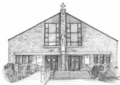
St. Teresa of the Infant Jesus 1634 Victory Boulevard Castleton Corners Staten Island, NY 10314