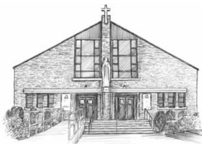
St. Teresa of the Infant Jesus 1634 Victory Boulevard Castleton Corners Staten Island, NY 10314