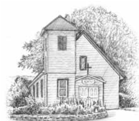
St. Nicholas Chapel La Bau Avenue and Northern Boulevard

Rectory Office Hours: Monday thru Friday, 9:00 am to 5:00 pm