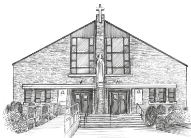
St. Teresa of the Infant Jesus 1634 Victory Boulevard Castleton Corners Staten Island, NY 10314