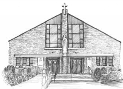
St. Teresa of the Infant Jesus 1634 Victory Boulevard Castleton Corners Staten Island, NY 10314