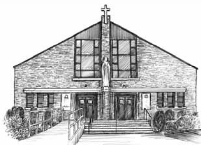
St. Teresa of the Infant Jesus 1634 Victory Boulevard Castleton Corners Staten Island, NY 10314