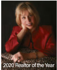
2020 Realtor of the Year

Licensed NYS Real Estate Broker, Licensed State of New Jersey Real Estate Salesperson