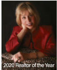
2020 Realtor of the Year

Licensed NYS Real Estate Broker, Licensed State of New Jersey Real Estate Salesperson