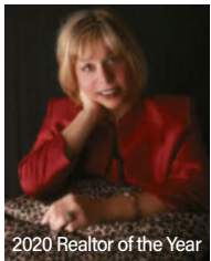
2020 Realtor of the Year

Licensed NYS Real Estate Broker, Licensed State of New Jersey Real Estate Salesperson