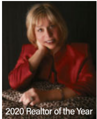
2020 Realtor of the Year

Licensed NYS Real Estate Broker, Licensed State of New Jersey Real Estate Salesperson