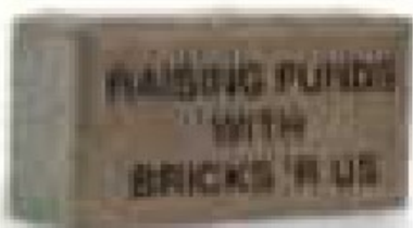
E4 - BROWN