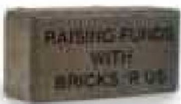
E58 - CHARCOAL/CAMEL

For more information, including available logos, please visit the following website: www.bricksrus.com/order/stanns