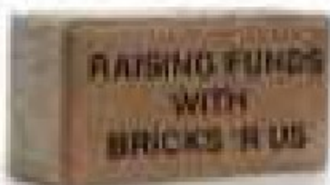
E2 - TAN

If you are purchasing a 4"x8" or 8"x8" brick, you may choose the color of your brick. Please write the code for your choice in the space provided. If you wish to include a logo at additional cost, please see Fr. Carrozza.