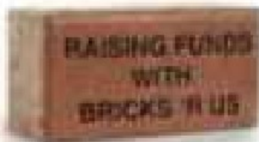
E9 - ORANGE