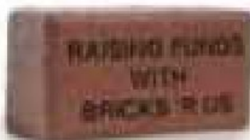
E3 - RED