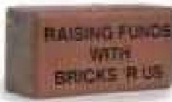
D5 - PEACH