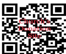
CHURCH DONATION SITE