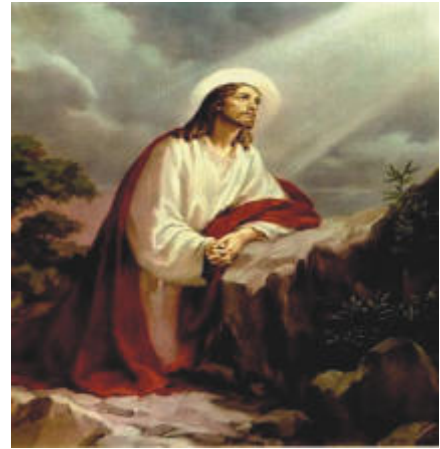
The Agony in the Garden

(if you are not attending the Mass everyone in the Parish should try to make a ten minute visit between 8-10pm)