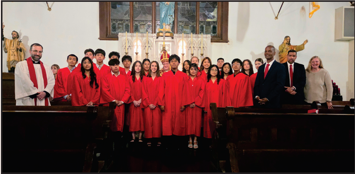
Confirmation Class - October 29, 2025