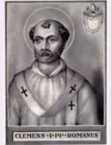
Pope Saint Clement I of Rome

From the Second Letter to the Corinthians of Pope Saint Clement I of Rome (r. 96-110)