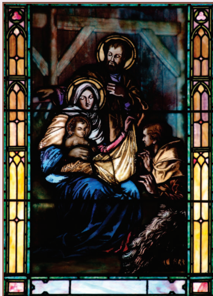
The Nativity of Our Lord A Window of Our Lady of the Rosary Chapel