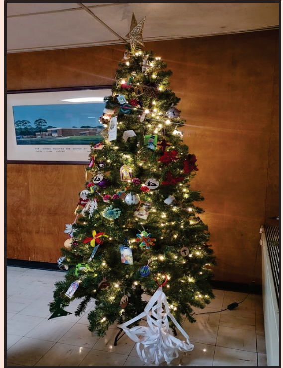
CCD Christmas Tree (In School Lobby)