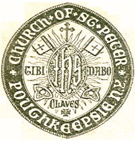
Original St. Peter's Seal