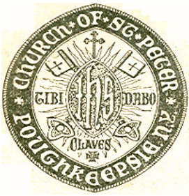
Original St. Peter's Seal