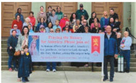
38 people attended the Rosary Rally at St. Augustine on October 16th.