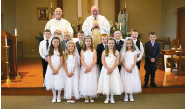
Holy Family Parish