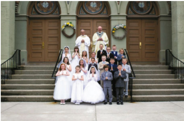
St. Augustine School