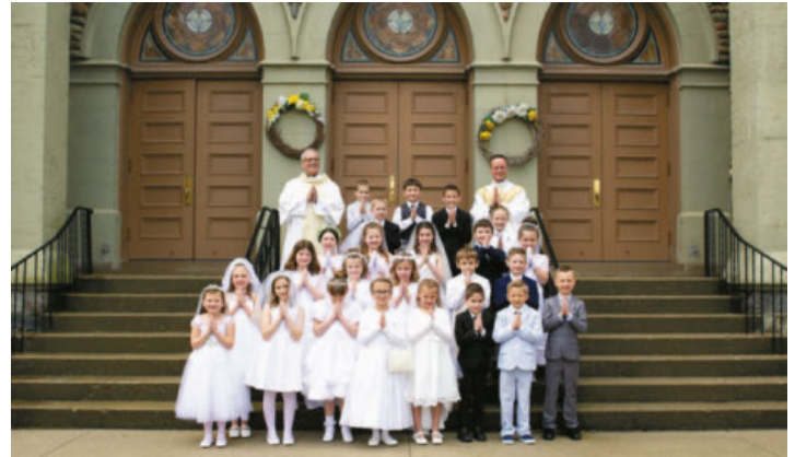
St. Augustine Parish