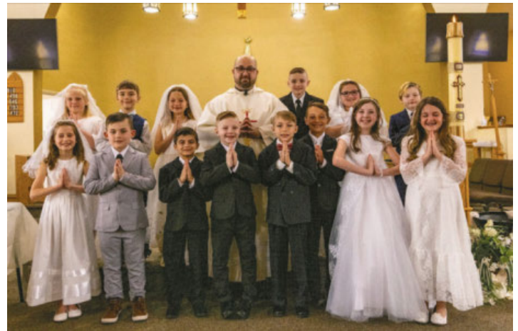
St. Mary Mystical Rose