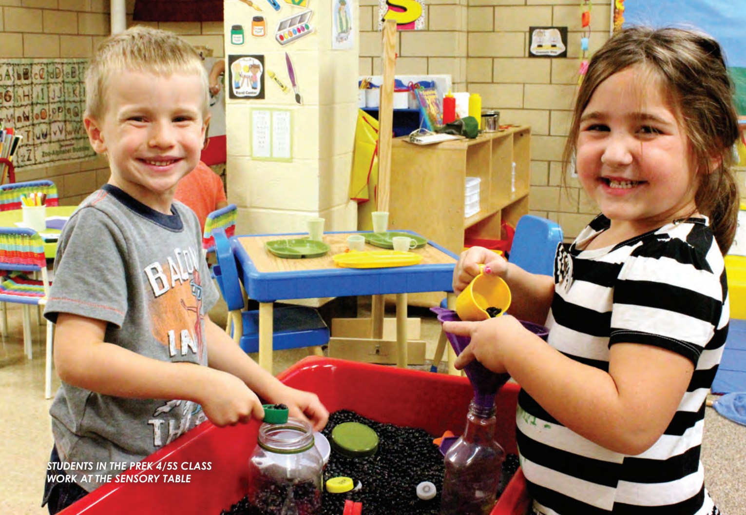
STUDENTS IN THE PREK 4/5S CLASS WORK AT THE SENSORY TABLE