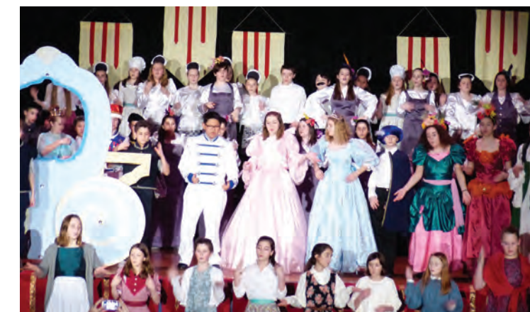
2017 MIDDLE SCHOOL PRODUCTION OF "CINDERELLA"