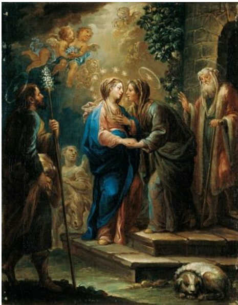
The Visitation of the Blessed Virgin Mary Feast Day May 31st